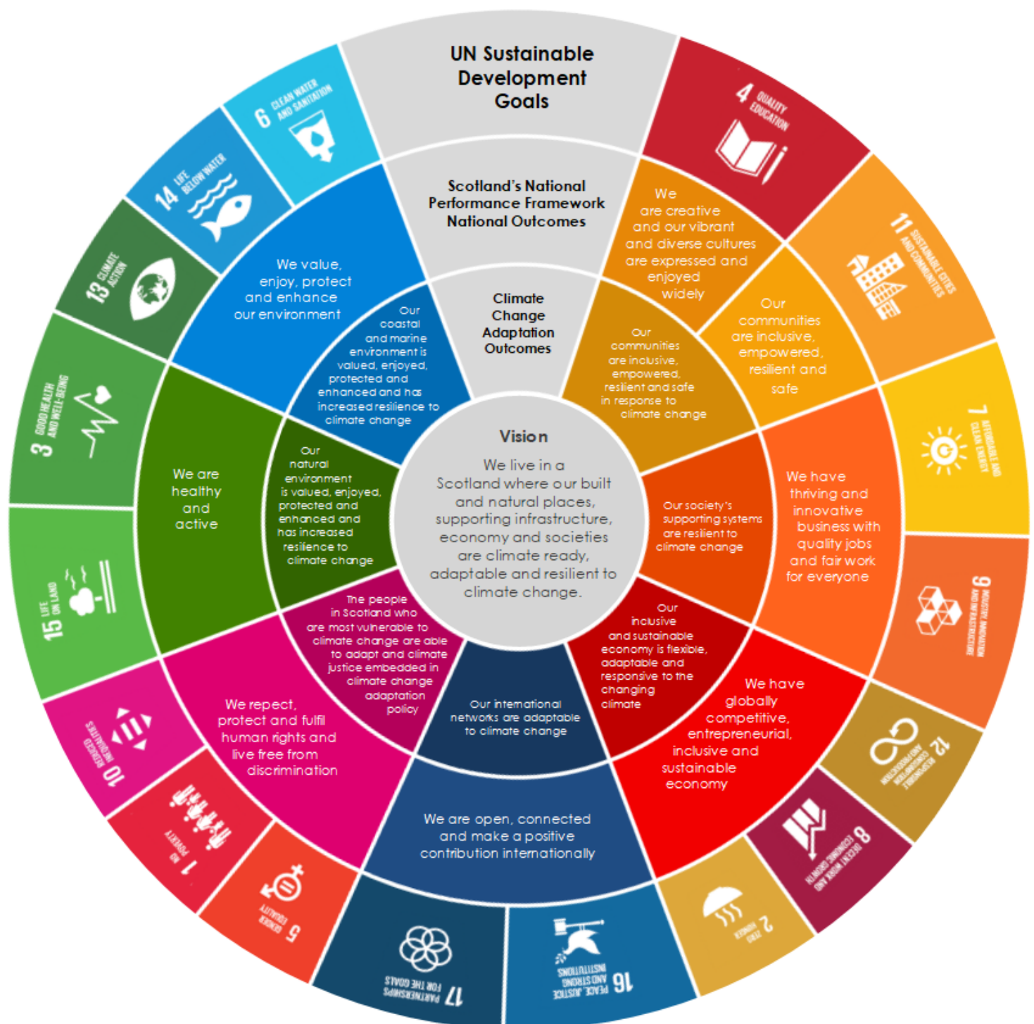
Diagram A: The Adaptation Programme's relationship to the UN Sustainable Development Goals and Scotland's National Performance Framework.