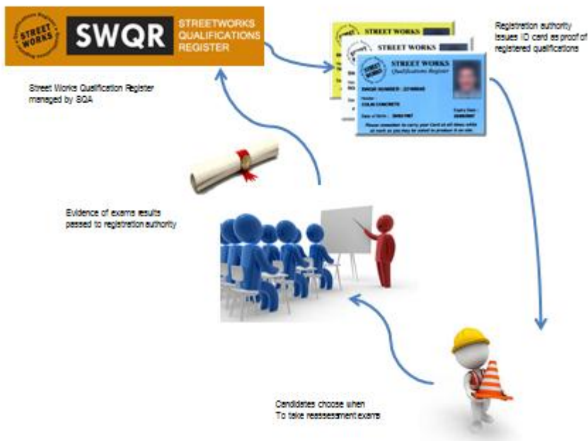
Figure 2 : Registration process

the regulations into line with current digital communications and may help streamline the process and perhaps reduce associated costs.